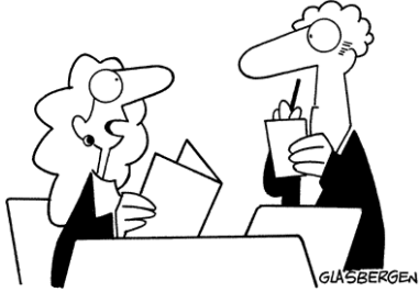
"I'm going to order a broiled skinless chicken breast, but I want you to bring me lasagna and garlic bread by mistake."